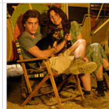
Previewing the Oscars