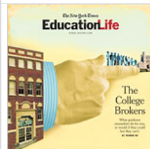
The College Brokers