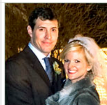
Weddings and Celebrations